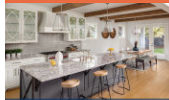
Build your dream kitchen

2.99% APR* see website or lender for details